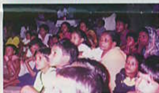
In UP, India, alone over 7,000 people have viewed the JF via the equipment placed by LWMI with

people that gave their lives to Jesus as a result of the film.