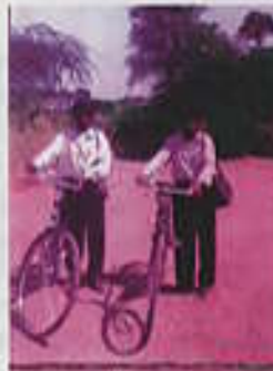
Arrows indicate where LWMI is working